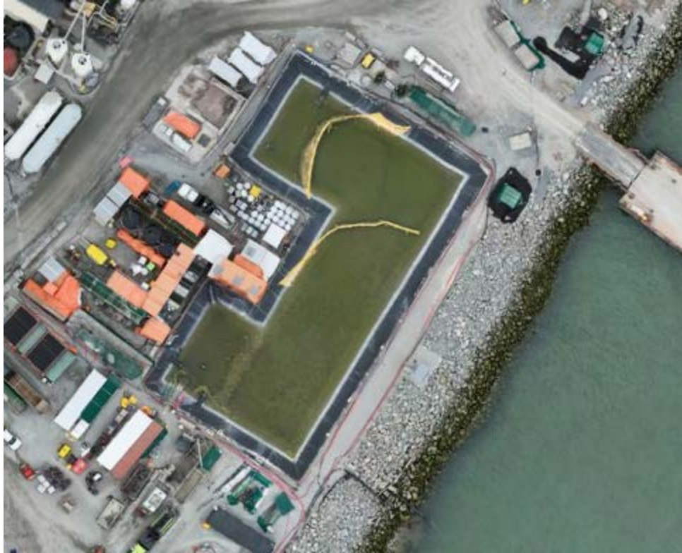
Figure 4: Aerial view of the East Sedimentation Pond (May 13, 2026). The East WWTP is located on the left side of the pond.