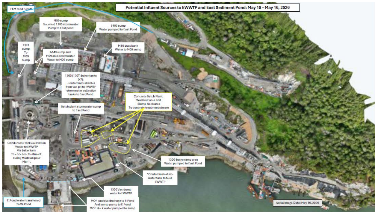
Figure 2: East Catchment contact water management facilities (May 10 – 16).