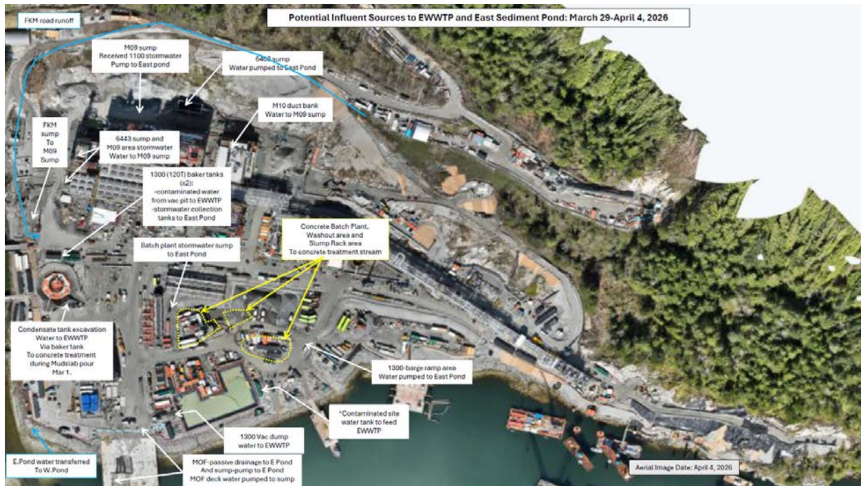
Figure 2: East Catchment contact water management facilities (March 29 – April 4).