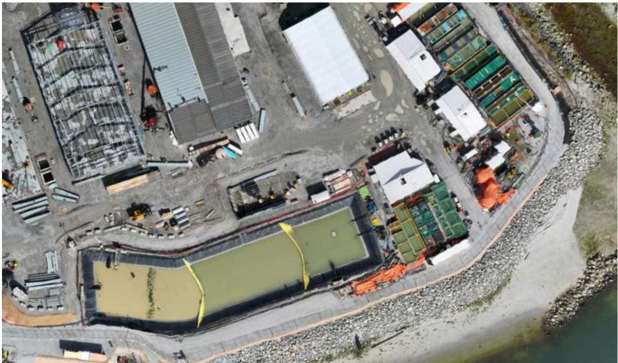
Figure 5: Aerial view of the West Sedimentation Pond (April 4, 2026).