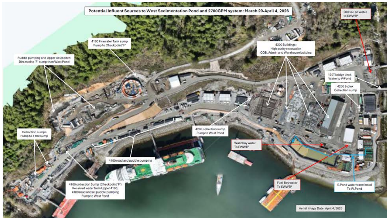
Figure 3: West Catchment contact water management facilities (March 29 – April 4).