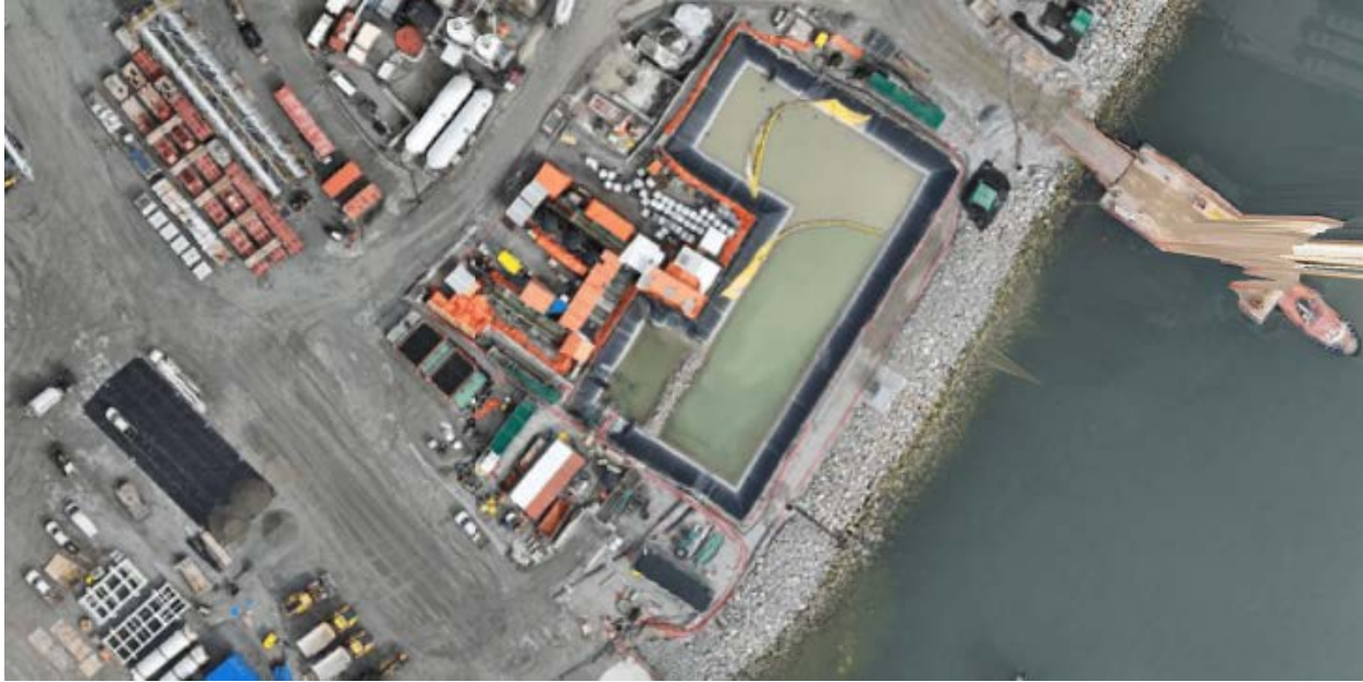
Figure 4: Aerial view of the East Sedimentation Pond (March 27, 2026). The East WWTP is located on the left side of the pond.