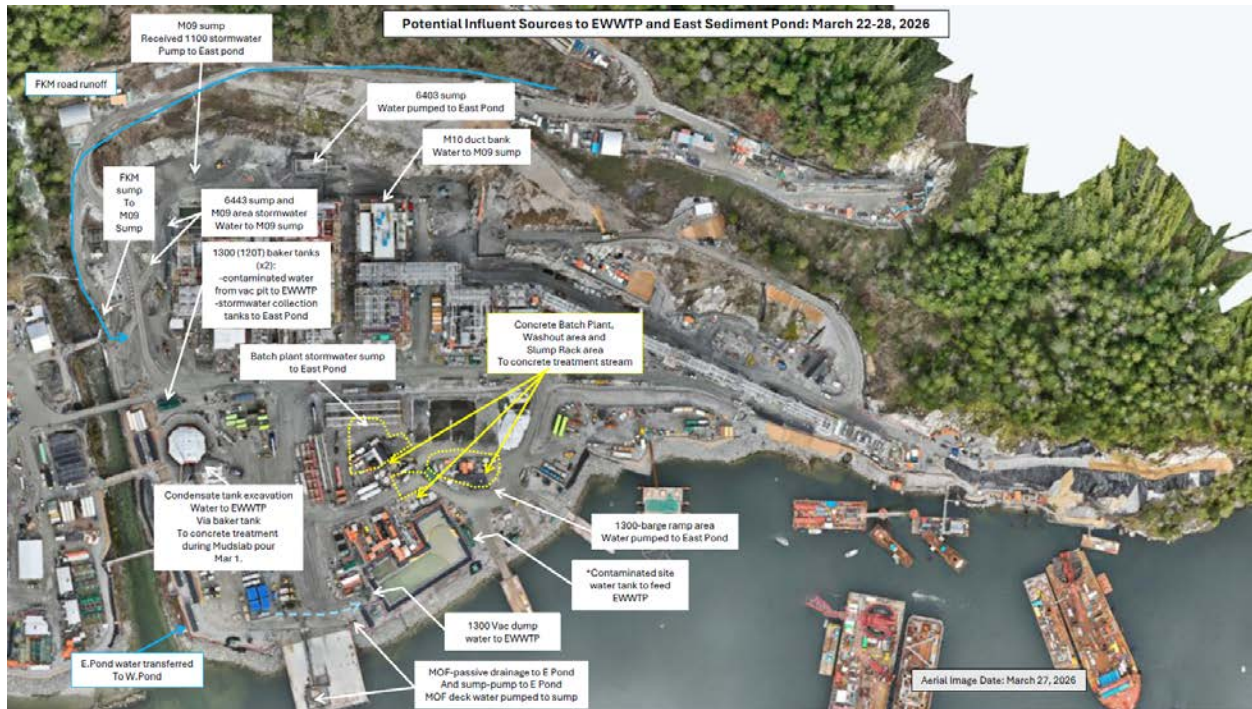
Figure 2: East Catchment contact water management facilities (March 22 – 28).