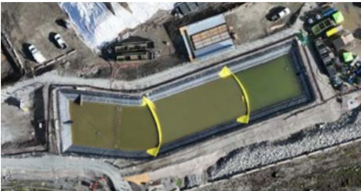
Figure 5: Aerial view of the West Sedimentation Pond showing the placement of two sediment curtains (August 28, 2024). The West WWTP is located on the right side of the pond.