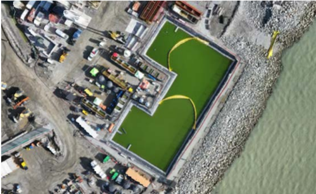
Figure 4: Aerial view of the East Sedimentation Pond showing the placement of two sediment curtains (August 28, 2024). The East WWTP is located on the left side of the pond.