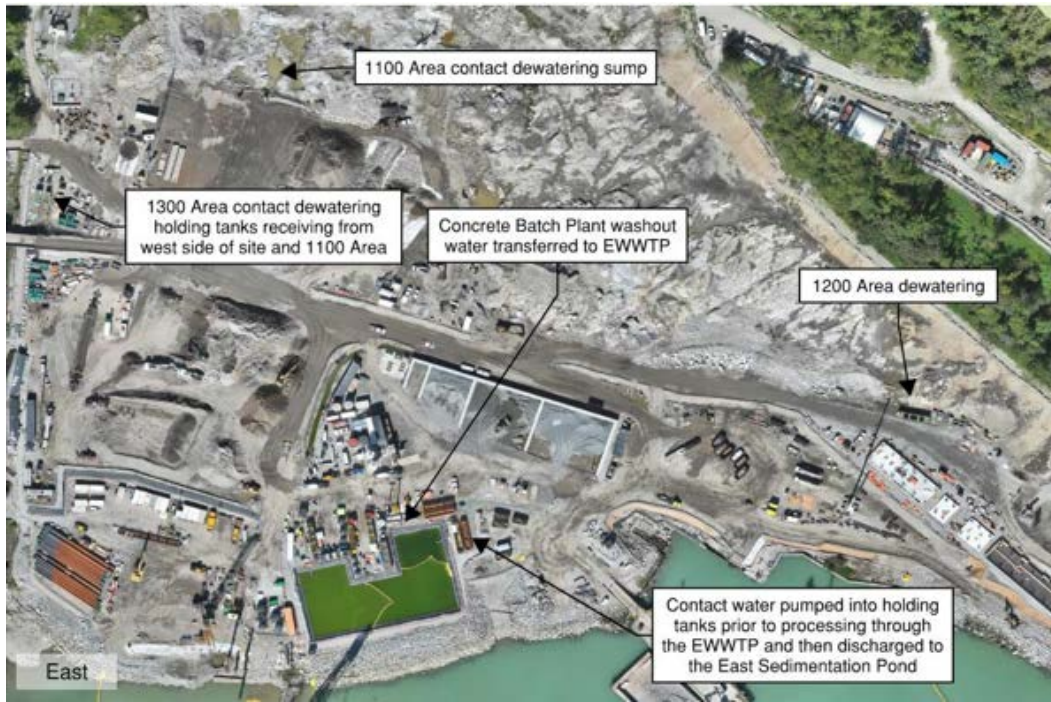
Figure 2: East Catchment dewatering areas. Contact water from the 1100 and 4200 Areas and small amounts of concrete wash water were directed to the East WWTP during the August 25 – 31, 2024 monitoring period.