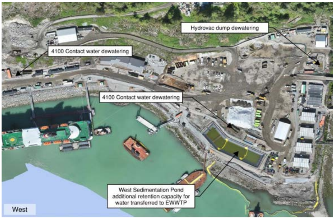
Figure 3: West Catchment dewatering areas. Dewatering of the West Catchment did not occur during the August 25 – 31, 2024 monitoring period.