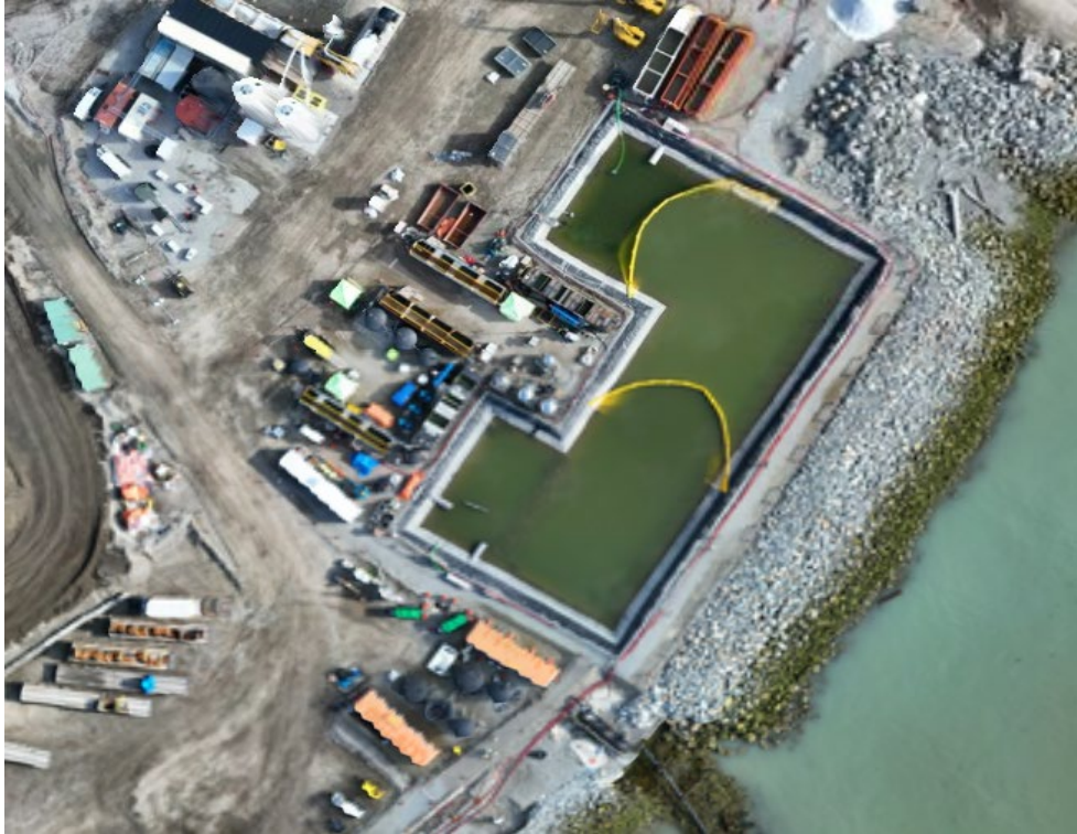
Figure 2: Aerial view of the East Sedimentation Pond showing the placement of two sediment curtains (July 2, 2024). The East WWTP is located on the left side of the pond.