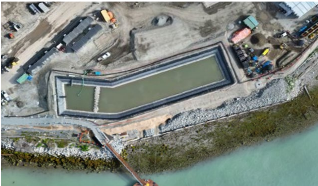
Figure 3: Aerial view showing the West Sedimentation Pond and West WWTP (located to the right of the pond) on July 2, 2024.