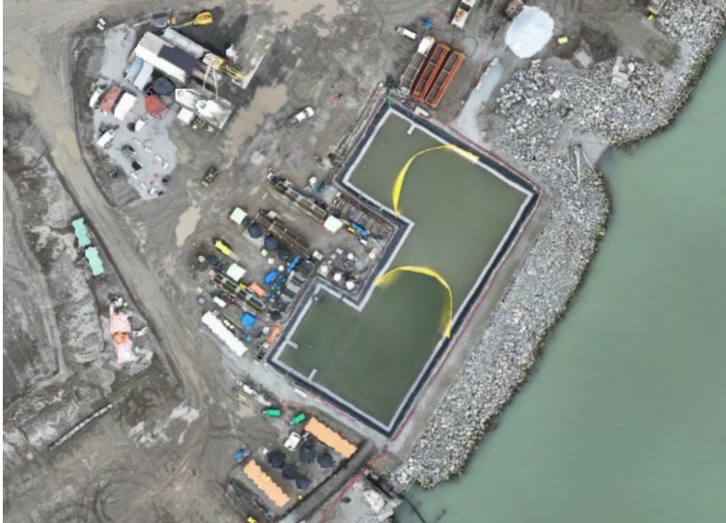
Figure 4: Aerial view of the East Sedimentation Pond showing the placement of two sediment curtains (June 28, 2024). The East WWTP is located on the left side of the pond.