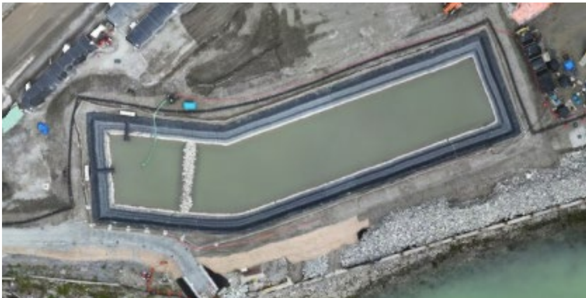
Figure 5: Aerial view showing the West Sedimentation Pond and West WWTP (located to the right of the pond) on June 28, 2024.