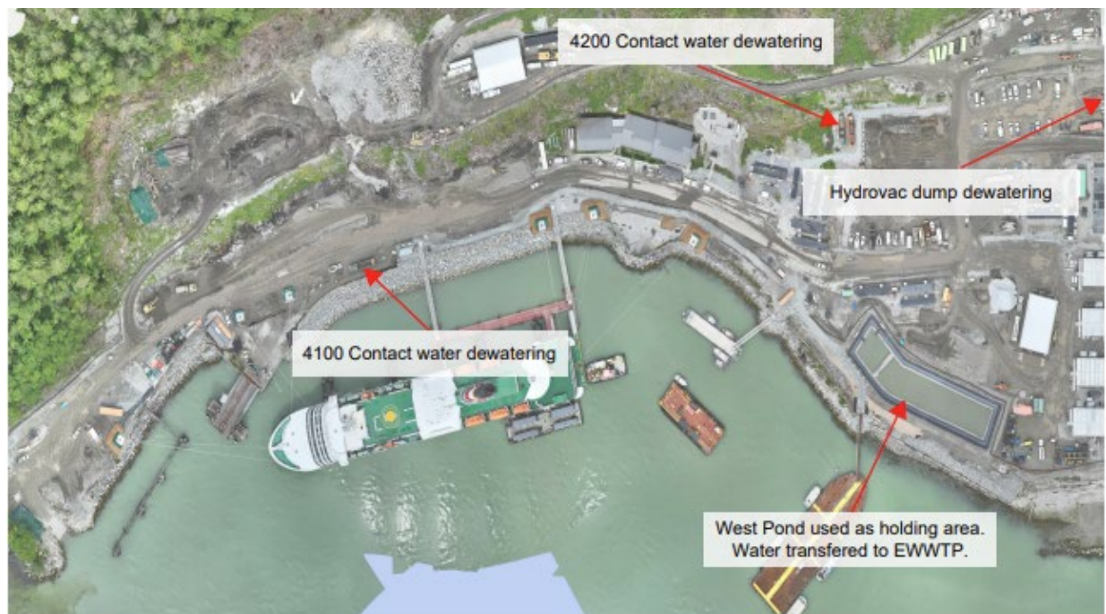
Figure 3: West Catchment Areas Dewatered to the East WWTP June 23 to June 29.