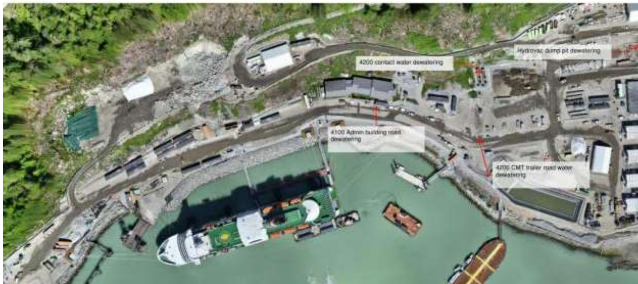
Figure 3: West Catchment Areas Dewatered to the East WWTP July 7 to July 13.