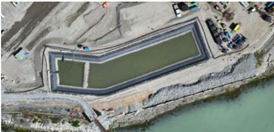
Figure 5: Aerial view showing the West Sedimentation Pond and West WWTP (located to the right of the pond) on July 12, 2024.