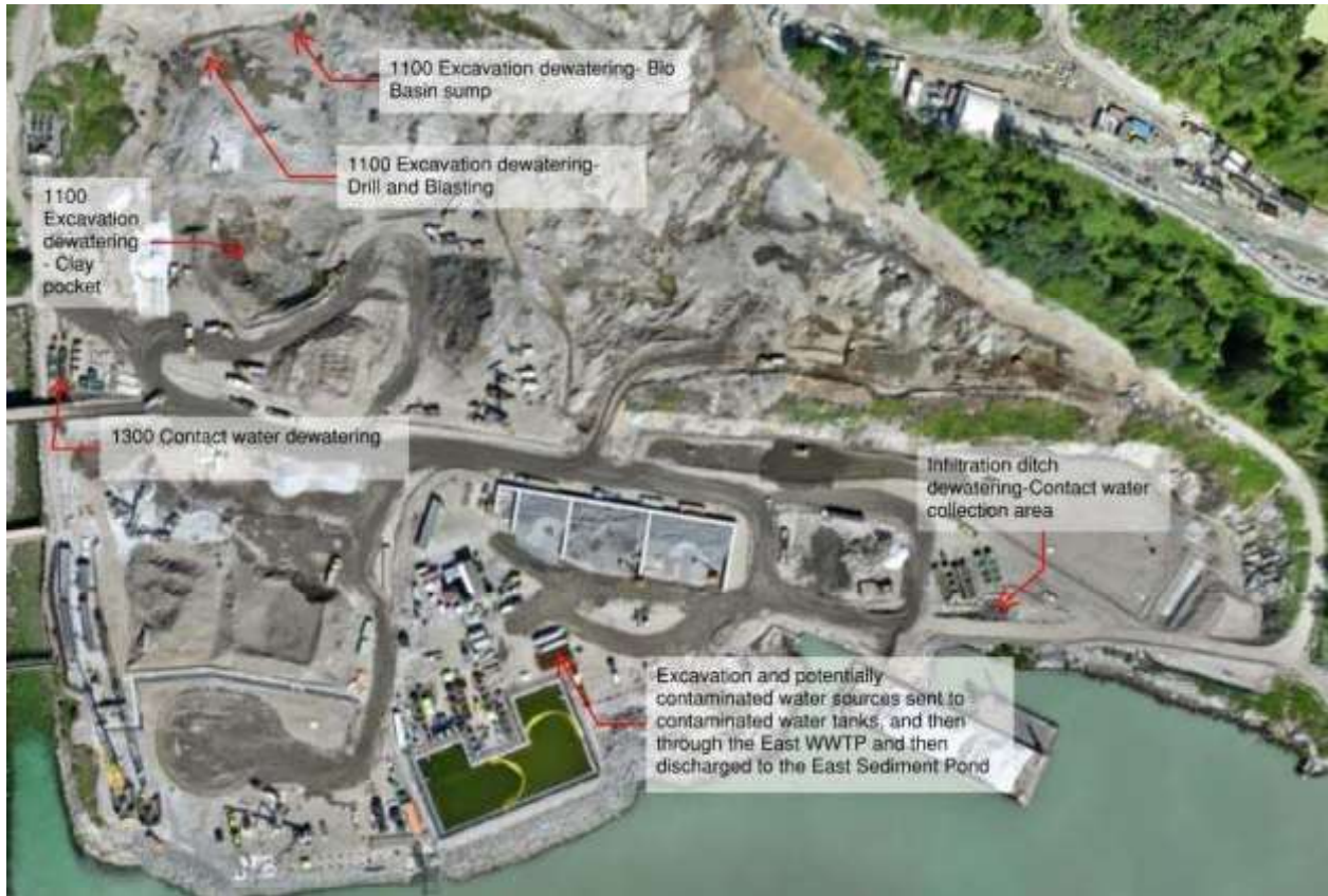
Figure 2: East Catchment Areas Dewatered to the East WWTP July 7 to July 13.