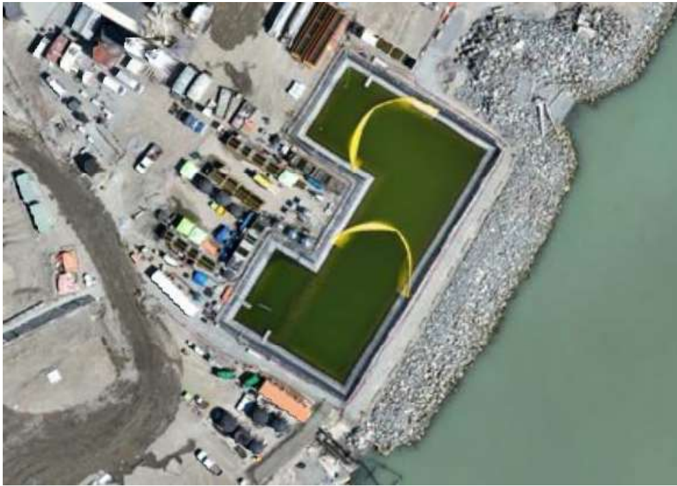
Figure 4: Aerial view of the East Sedimentation Pond showing the placement of two sediment curtains (July 12, 2024). The East WWTP is located on the left side of the pond.