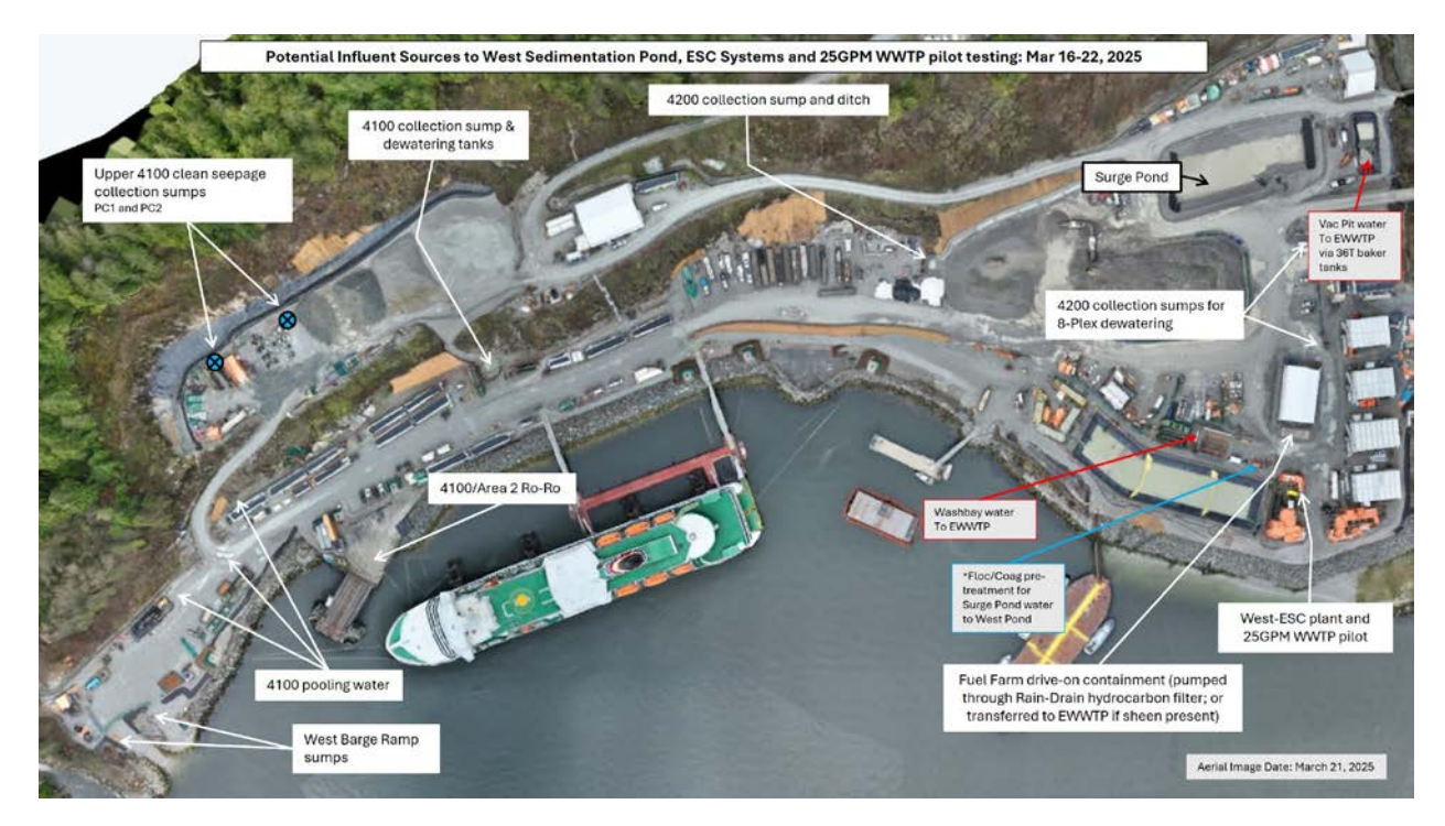
Figure 3: West Catchment contact water management facilities (March 16 – March 22).