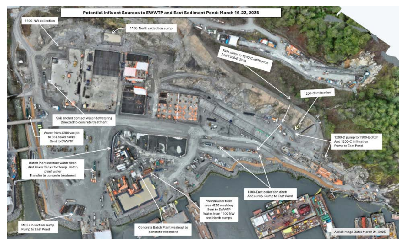
Figure 2: East Catchment contact water management facilities (March 16 – March 22).