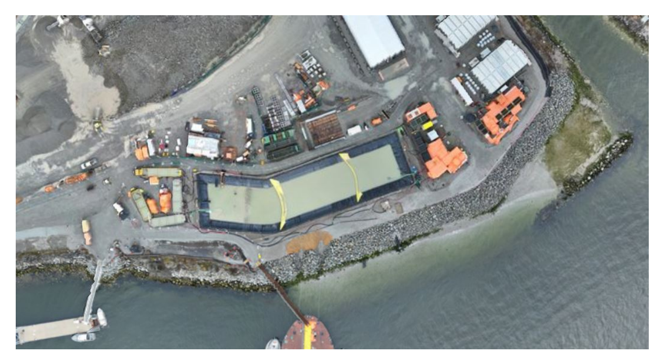
Figure 5: Aerial view of the West Sedimentation Pond (March 21, 2025). The TSS settling systems are located to the left (W500GPM) and right (ESC) of the pond.

Figure 4: Aerial view of the East Sedimentation Pond (March 21, 2025). The East WWTP is located on the left side and the E500GPM TSS settling system is situated along the bottom edge of the pond.